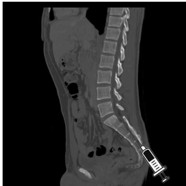
Figure 3. Sagittal C.T. scan view of the injection in the hiatus.

Possible side effects of sacral injections include bleeding, infection, and spinal headache if there is an accidental puncture of the dura. Additionally, patients may experience temporary side effects from the steroid used, such as flushing, elevated blood sugar, headache, muscle cramps, increased appetite, mood swings, and difficulty sleeping.