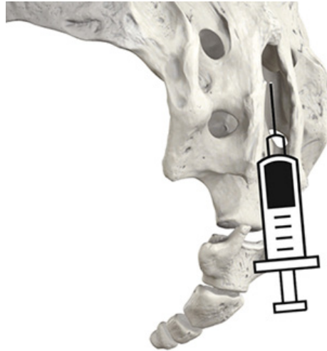
Figure 2. Oblique view of the injection in the hiatus.

involve injecting numbing medicine and a steroid into the epidural space near the tailbone to alleviate nerve pain and inflammation. While the effectiveness of sacral injections varies among patients, they are generally considered safe with minimal risks of complications [1-3].