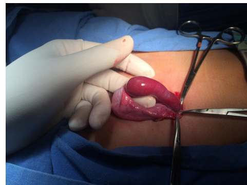
Figure 1: Discontinuous splenogonadal fusion

The histopathological report explains in the macroscopic description a vermiform tubular tissue of 7 cm in length and thickness of 1.3 cm of rubberized consistency compatible with splenic ectopic tissue without significant histopathological alterations or associated with gonadal tissue or mesonephric derivatives.