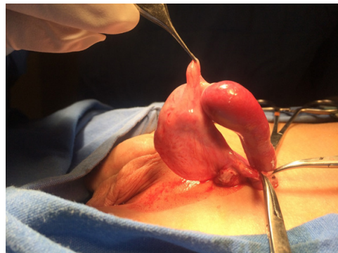
Figure 2: Discontinuous splenogonadal fusion