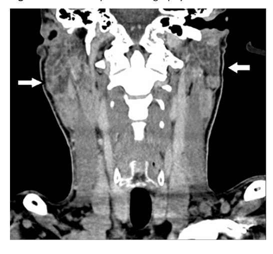
Figure 1: Neck Computer Tomography Scan.

Lymphadenopathy in bilateral neck chains (white arrows).