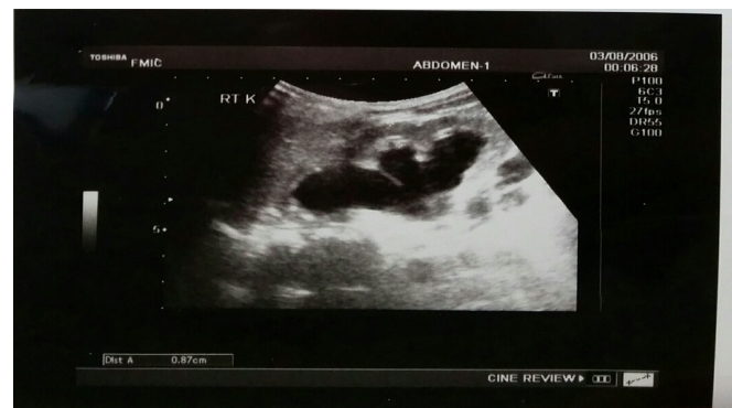
Figure2: Longitudinal scan of right kidney demonstrated moderate dilatation of pelvicalyceal system as well as proximal ureter.

No vesico-ureteric reflux was detected during the procedure with multiple attempts. However, complementary ultrasound demonstrated bilateral moderate hydronephrosis and hydro-ureter down to the level of vesico-ureteric junction as well as urinary bladder wall thickening and irregularities. (Figure 2, 3, 4)