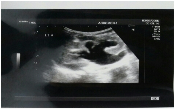
Figure3: Longitudinal scan of left kidney demonstrated moderate hydronephrosis and proximal hydroureter.