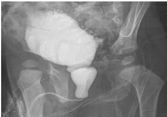
Figure 1: Left anterior oblique view during micturition; A linear lucency is visible at the level of posterior urethra representing urethral valve

A two-year-old boy with history of dribbling, difficulty in urination, and abnormal growth was referred to radiology department of FMIC hospital to undergo micturating cystourethrogram (MCUG). The fluoroscopic procedure was performed and urinary bladder was distended with contrast material through in placed Foley catheter. During voiding phase of the cystourethrogram, a linear lucency was apparent at the level of posterior urethra with proximal dilatation. Urinary bladder demonstrated irregular outlines along its posterior wall with some diverticular formations. (Figure 1)