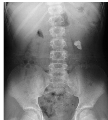
Figure 1: Multiple radio-opaque Stones in the left flank region.

junction obstruction of upper kidney (normal position left kidney) and renal pelvis stones of lower kidney(right fused ectopic kidney) was performed. Then patient was introduced for surgery department for nephrolithotomy as well as treatment of upper moiety uretero-pelvic junction obstruction. The lithotomy with junction-junction (JJ) stent procedure was done. Post operation plain image demonstrated no evidence of renal stones with a normal JJ stent location into the upper moiety kidney and urinary bladder [Figure. 5]. Also post operated ultrasound images showed no evidence of stones and hydronephrosis with a normal JJ stent position [Figure. 6, 7].