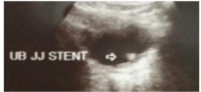
Figure 7: Post operation ultrasound shows tip of JJ stent inside the urinary bladder.

dence of a notch between them and JJ stent in the upper kidney with no evidence of stone in lower kidney.