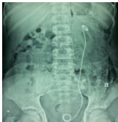
Figure 5: No evidence of renal stones after operation with a normal JJ stent position into the upper moiety kidney and urinary bladder.