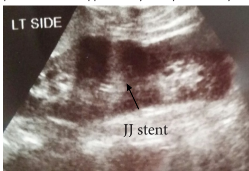
Figure 6: Post operation ultrasound image shows fused kidneys with evi-

dence of a notch between them and JJ stent in the upper kidney with no evidence of stone in lower kidney.