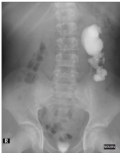
Figure 4: Single ureter with normal caliber is seen in the left side showing passage of contrast into the urinary bladder.