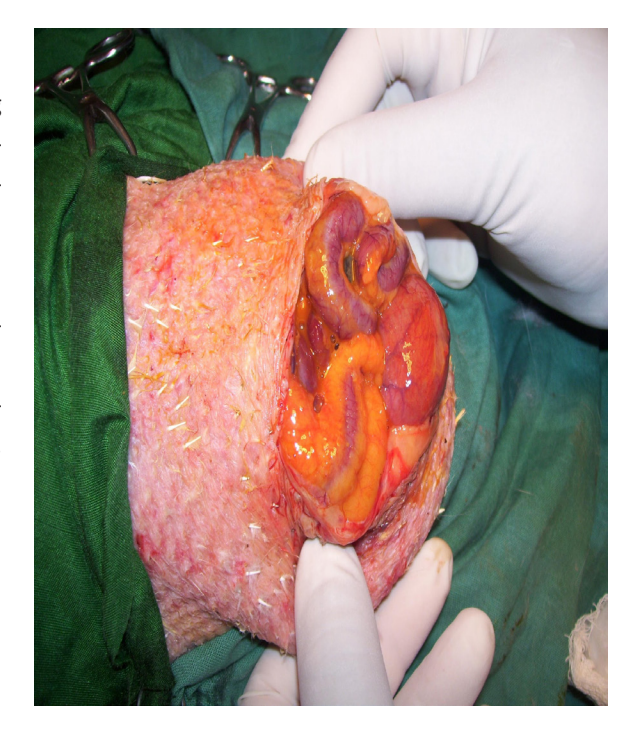
Figure 2: Contents seen after the initial incision.

After the pre-surgical starvation of 30 minutes, the duck was placed under general anaesthesia using the anesthetic regime of Diazepam/ Ketamine as described by Dar et al, [8]. Diazepam (Lori®, Neon laboratories Limited, Mumbai, India) @ 1mg/kg body weight was administered intramuscularly (IM) into the pectoral muscle then five minutes later when the sedation was achieved Ketamine (Aneket®, Neon laboratories Limited, Mumbai, India) @ 15 mg/kg was administered IM into the pectoral muscle. The bird was restrained in dorsal recumbence and the head raised about 30°. The wings were reflected dorsally while the legs were restrained and abducted in caudal direction. After preparation of the operation field, a ventral midline celiotomy were performed. Corrective surgery involved a procedure in which an elliptical transabdominal incision through the skin and abdominal muscles was performed to reduce the size of the distended hernial sac by removing part of the abdominal wall (Figure 2).