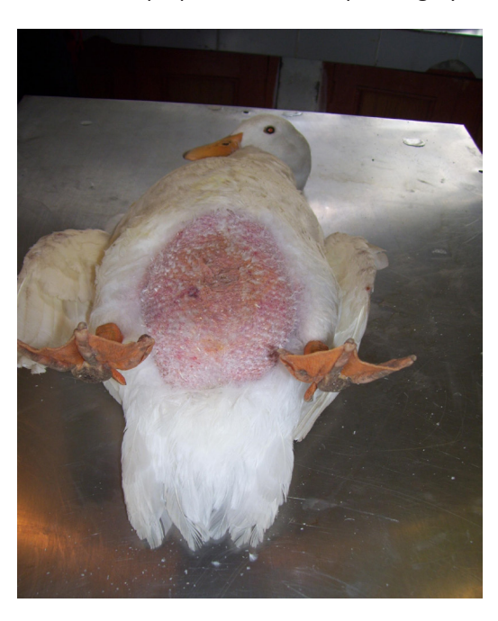
Figure 1: View of the abdominal swelling.

A spherical painless, reducible swelling about 7.5 cm extending from the keel to the pubic bones located in the ventral abdomen region close to the cloaca. The presented data enabled us to make a diagnosis of abdominal hernia (Figure 1). The bird was prepared for the aseptic surgery.