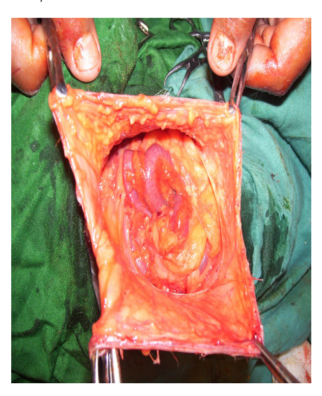
Figure 3 : Content of hernial sac (intestinal loops covered with fibrin mesh).

The incision was then extended with fine scissors. The skin was the only structure of hernia sac holding the content of abdominal organs as the hernial sac. The hernia consisted of ileum and cecum loops glued with adhesions in the form of a fibrin mesh which formed one ball. All contents were returned back into the abdominal cavity. The linea-alba was sutured by a simple interrupted suture pattern using No. 2/0 catgut (Figure 3).